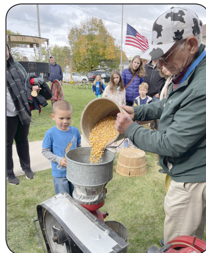
After shelling an ear of corn by cranking the corn sheller, this young man watches as the kernels are pulverized in the grinding mill

The weather was a bit brisk, but it did not deter our visitors. We believe we had more people than we did for Historic Day. MobCraft Beer provided liquid refreshment and our Gazebo was busy serving lunches and desserts. Kids shelled corn, pressed apples for cider, and visited with the miniature horses. All of the buildings were very busy and we received many compliments on our displays.